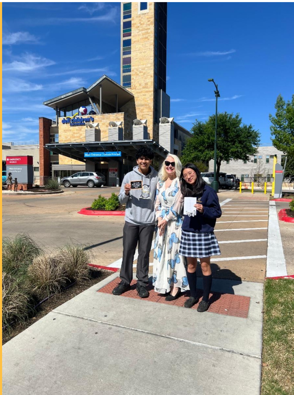
St. Dominic HS "Hearts of Hope" students

Colton's Hope is displayed in the spiritual cases at Lake Travis Thrift Shop...please come to check it out!