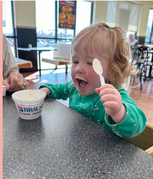
What an angel as she is a light in so many lives.

"Spread LOVE everywhere you go. Let no one ever come to you without leaving happier".